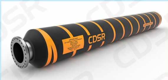
51100 - Single Carcass Floating Hose