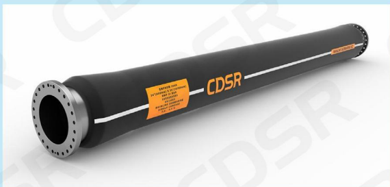
51200 - Single Carcass Submarine Hose