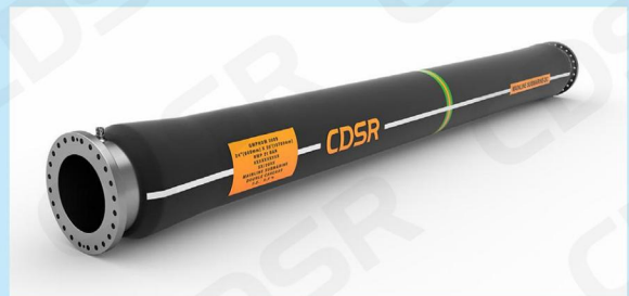
52200 - Double Carcass Submarine Hose