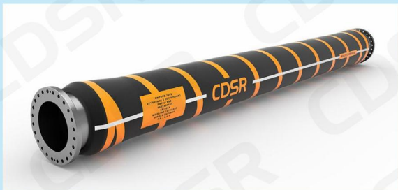
51300 - Single Carcass Catenary Hose